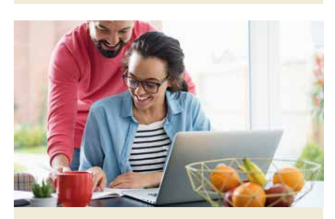
"We were impressed by the whole process of buying our house and we particularly enjoyed the choices we were offered on tiles and fittings."